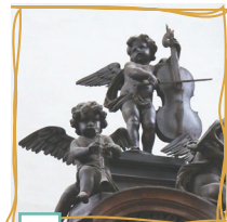
Angels playing music