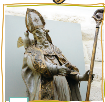
Saint and dove