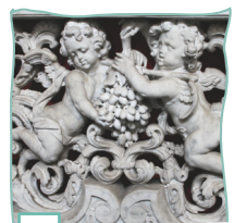
Angels with a bunch of grapes