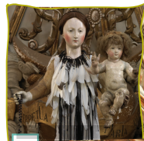
Our Lady of Succour