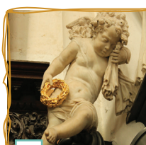
Angel with a crown of thorns