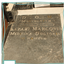
Tomb of Lazarus Marcquis