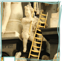
Angel with a ladder and sponge