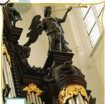
Angel with a clarion