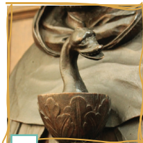
Snake in chalice