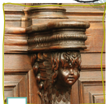
Angel near the church stalls